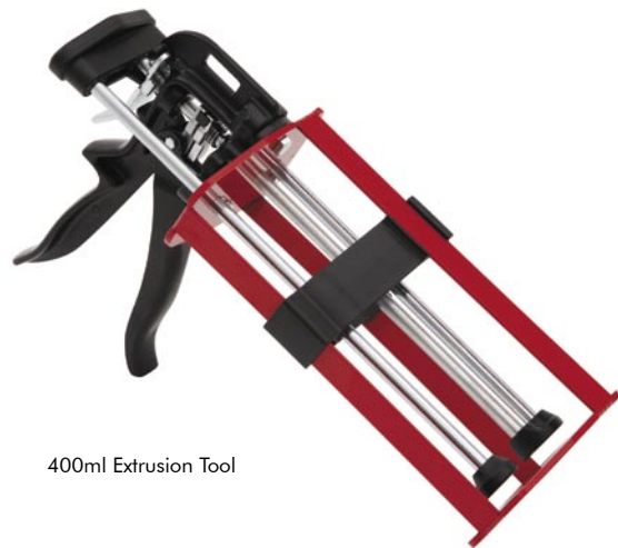
400ml Extrusion Tool

Once the damaged, decayed and discoloured wood has been removed by use of a suitable cutter tool such as a router or chisel, then the area to be treated is lightly sanded to ensure excellent adhesion. The moisture content of the wood should be no greater than 18% (check using a standard moisture meter) and damp wood should be allowed to dry naturally, or by way of a hot air gun. The two components are mixed manually into a separate container, and thoroughly agitated for one minute. The 2:1 mixing ratio should be strictly observed. EWS should be applied directly onto bare wood in the repair area using a standard brush and then left to cure for 30 minutes, prior to carrying out the repair. Please refer directly to the Timbabuild® EWS data sheet for more details.