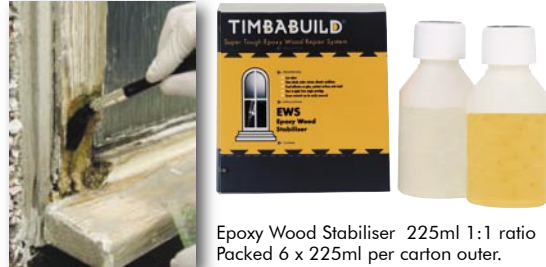
Epoxy Wood Stabiliser 225ml 1:1 ratio Packed 6 x 225ml per carton outer.

EWS primer system is a specially designed two-part low viscosity, solvent free, resin solution which is designed to strengthen weakened wood fibres by penetrating deep into the wood. The product is used as a primer in conjunction with the Timbabuild Wood Repair systems.